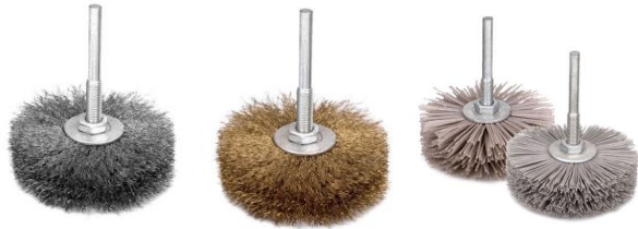
Flower head ( stai Flower head / Flower head ( DuPont )