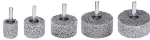
Fiber grinding head