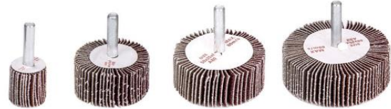
Handle nage wheel grinding head